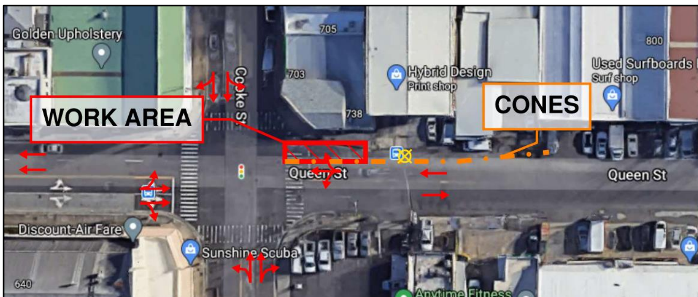
Phase1A: Cooke Street & Queen Street Makai Intersection