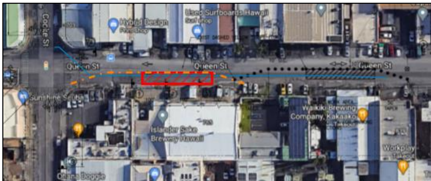
Phase 1B: Cooke Street & Queen Street