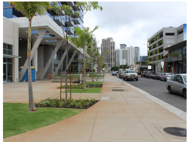
Top: At The Collection, the project is “wrapped” with commercial uses and townhomes. Middle: Wider sidewalks and landscaping contribute to a more open feel between The Collection and SALT at Our Kakaako.