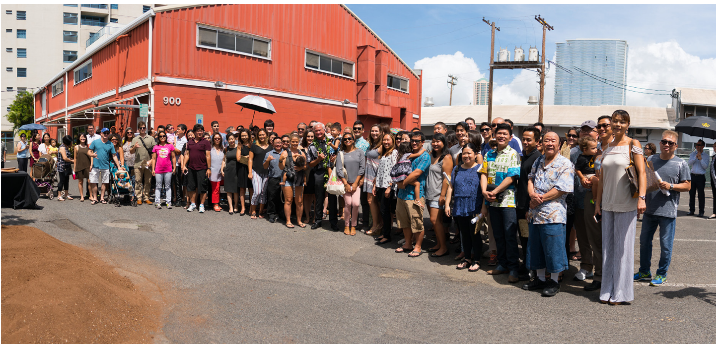
Future Ke Kilohana residents attend a groundbreaking ceremony. Ke Kilohana will have 375 Reserved Housing units. The project is expected to be completed in 2018. - Courtesy photo

For more information on the Reserved Housing program and to view the rules governing it, please visit our website at www.hcdaweb.org