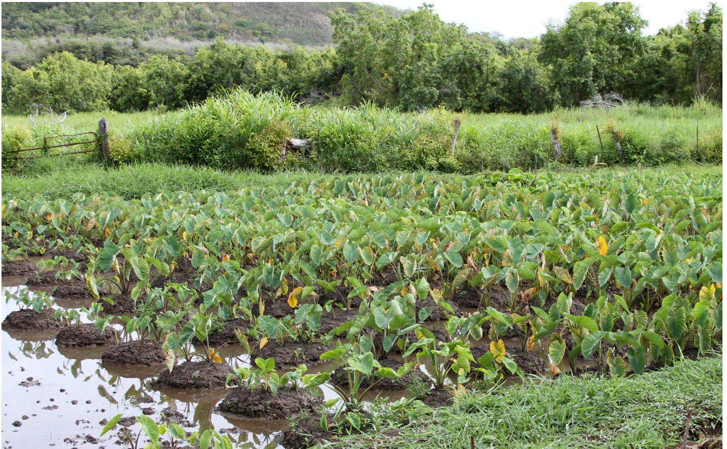
With support from the community, lessee Kakoo Oiwi has converted 12 acres of wetland to loi, improving taro production, and restored portions of major historic farm roads in Heeia.

The Authority has initiated the Heeia Master Plan and Rule-making process with the consultation of stakeholders and community members. The plan is expected to promote restoration of the natural systems and environment and provide an opportunity for economic, social and cultural programs. It would also outline infrastructure improvements that are necessary.