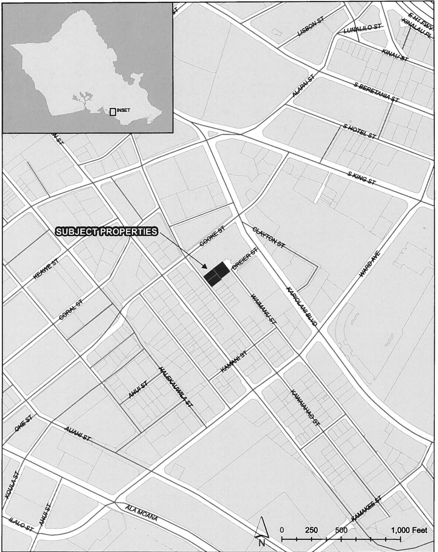
Figure 1 - Location Map