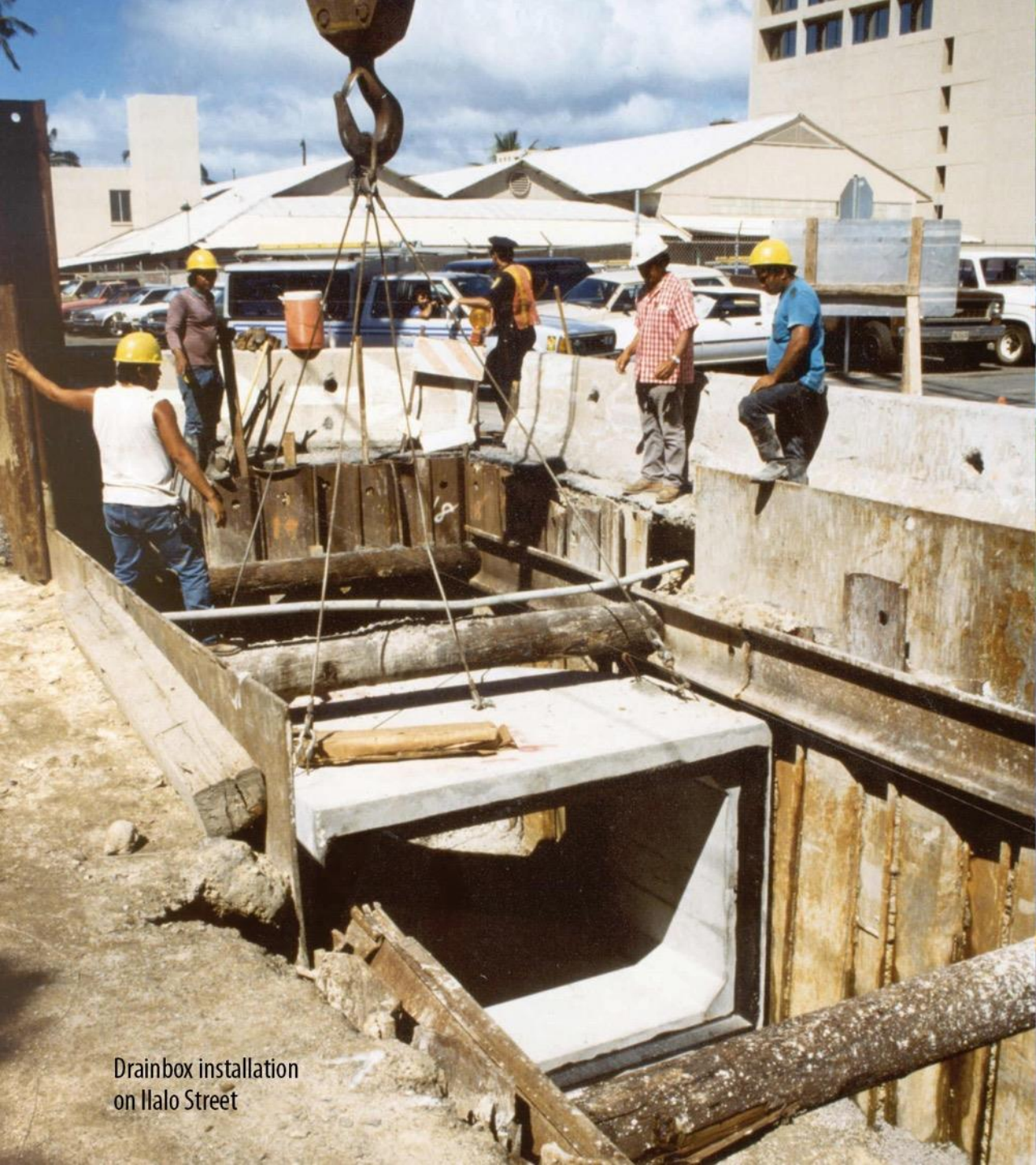
Drainbox installation on Ilalo Street