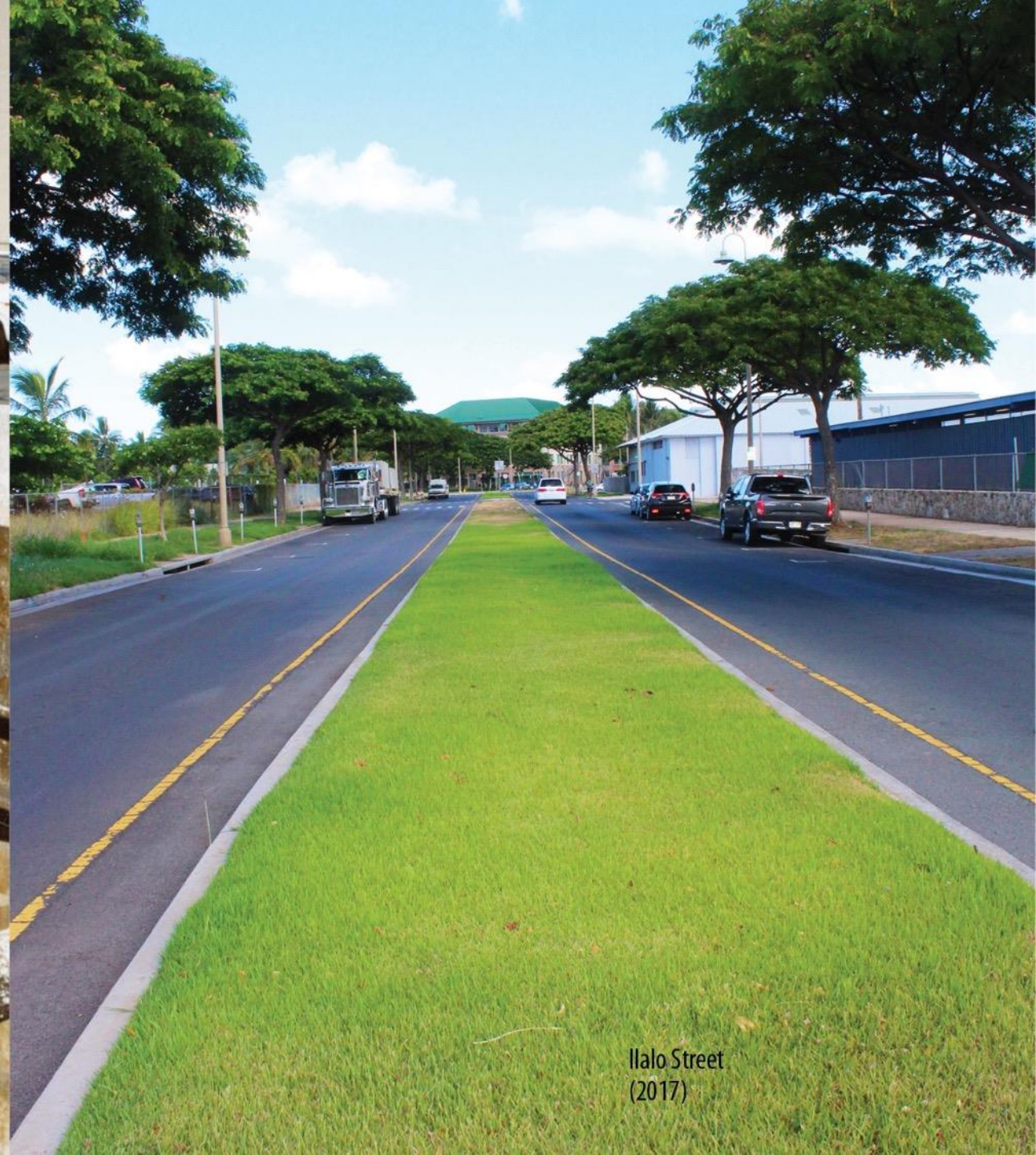
Ilalo Street (2017)