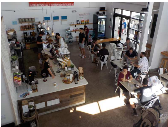
Morning Brew Kakaako

Quantitatively, Morning Brew Café has reduced their plastic usage by 3,000 plastic cups a week and 5,000 straws a month. Morning Brew Café adheres to criteria No. 3 with only reusable plates, cups, and utensils being used onsite.