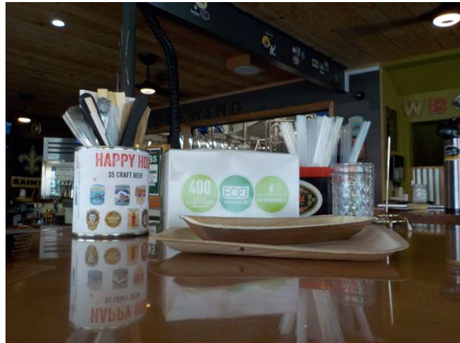
Waikiki Brewing Company Kakaako Pub