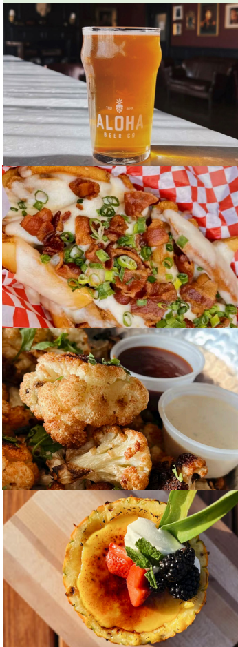
Aloha Beer, bacon-fondue fries, cauliflower wings, and creme brulee.

If you want to include an event, know an individual or a business in Kaka'ako, Kalaeloa or He'eia that we could feature, or just want more Community Connection, let us know by emailing us at: dbedt.hcda.contact@hawaii.gov .