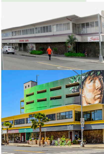
Before & after photos by Kamehameha Schools.

"I think with KS, we're not so much about place