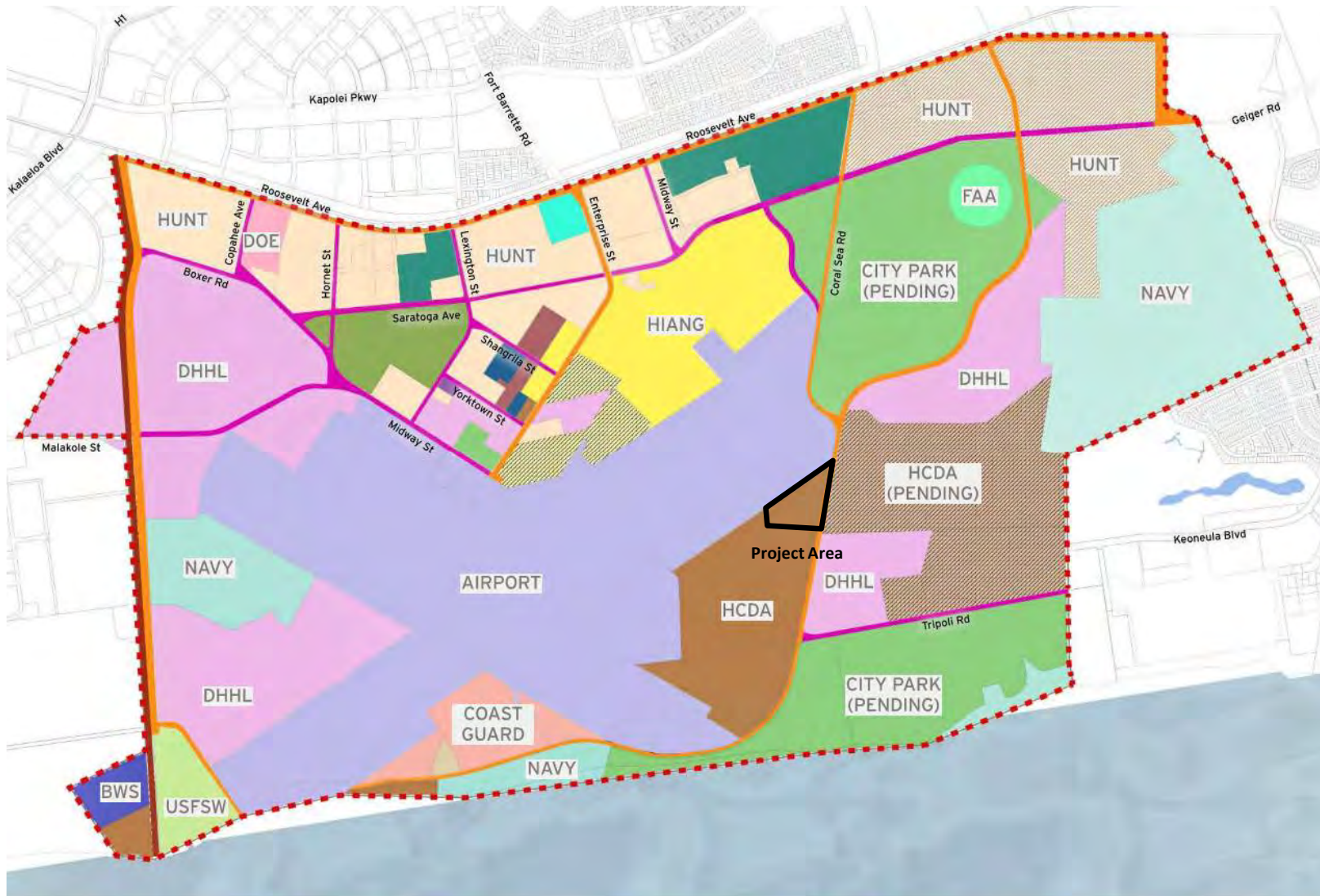
Kalaeloa Land Ownership Map