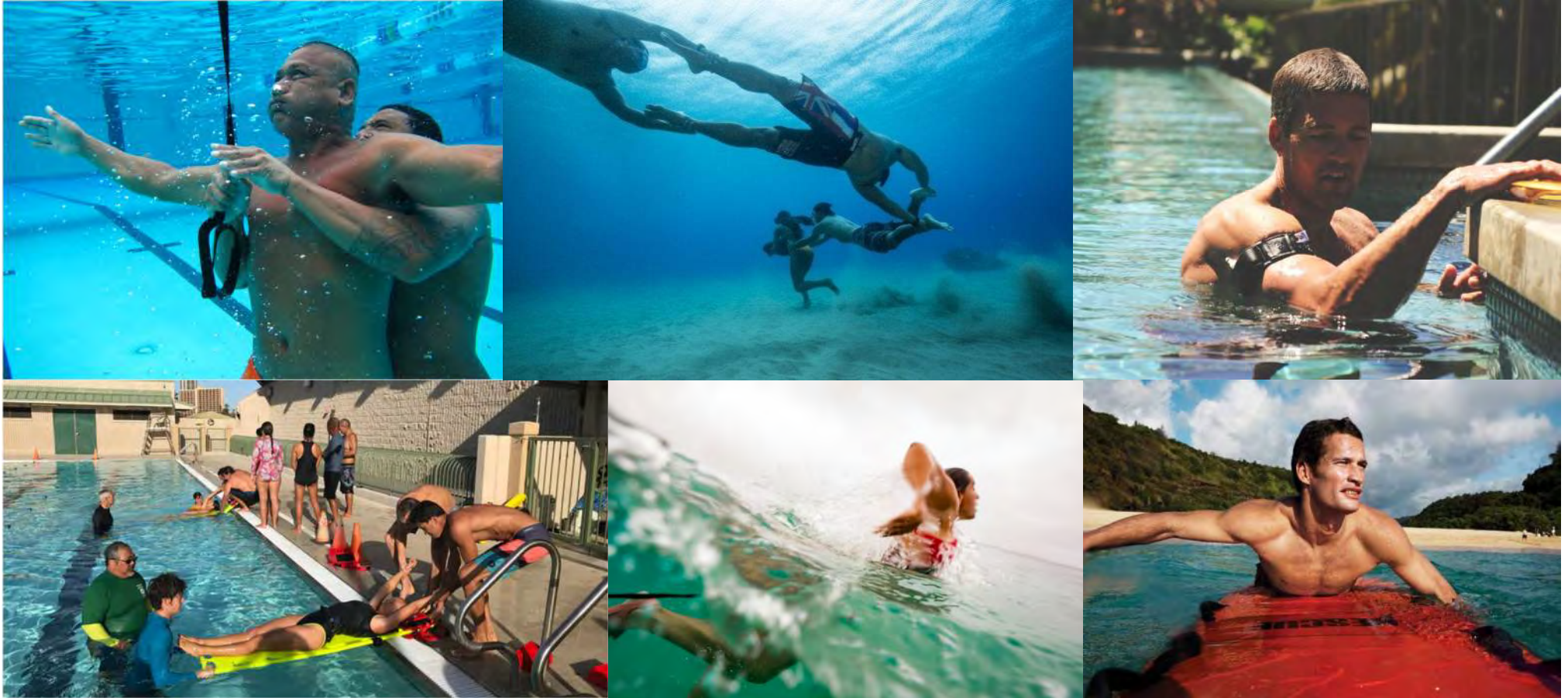
Kia'i ola (Guardians of Life) Lifesaving Lab / Life Safety Training