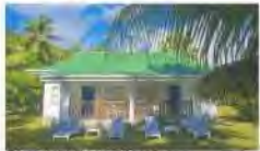
Overnight Recreation Camp Bungalows