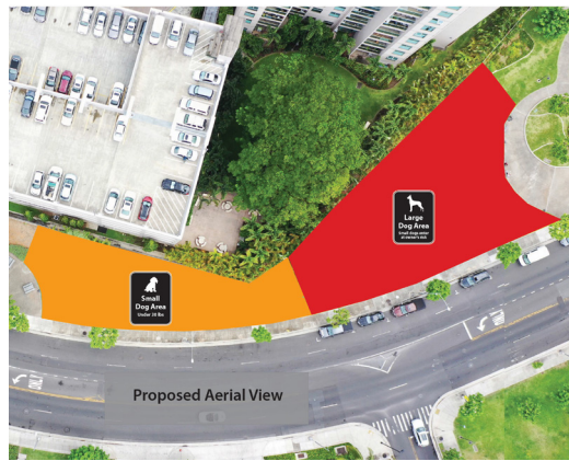
Proposed Kolowalu Mauka Off-Leash Dog Park

The Hawaii State Legislature appropriated funds to HCDA, via H.B. 1600, for the design and construction of the off-leash dog park and the next phase of the crosswalk project—permanent raised refuge island, crosswalk, and flashing beacons.