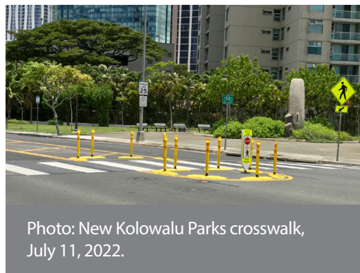
Photo: New Kolowalu Parks crosswalk, July 11, 2022.