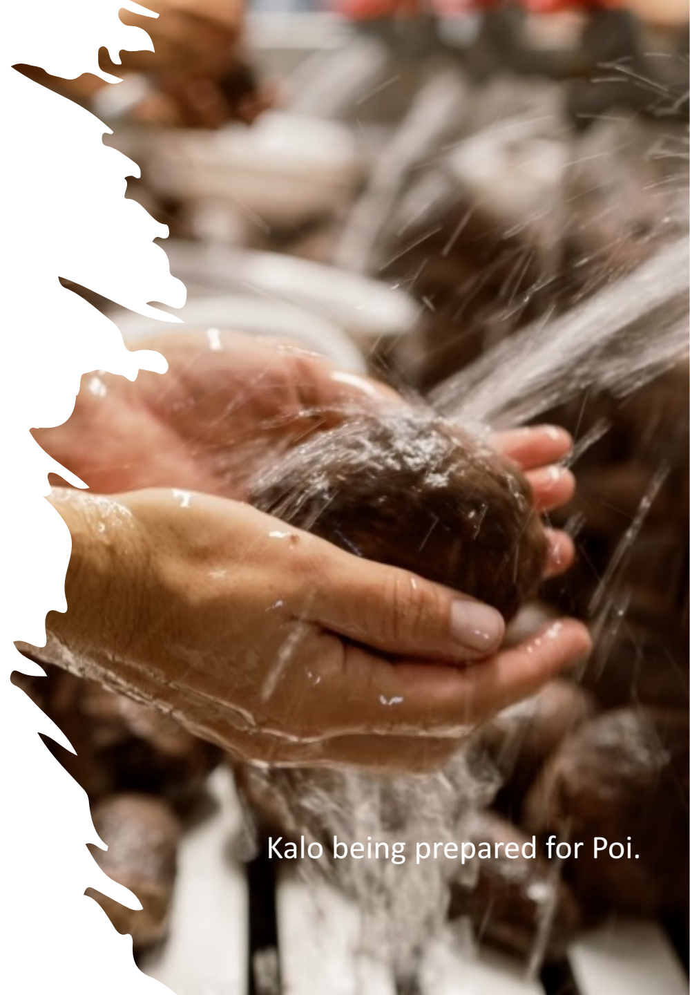
Kalo being prepared for Poi.

We have been able to share over 20,000 pounds of food, a value of over $120,000 with our community and supporters, Heeia community, Koolaupoko Hawaiian Civic Club, Lunalilo Home, Kokua Kalihi Valley, Hawaii Food bank, and restaurants.