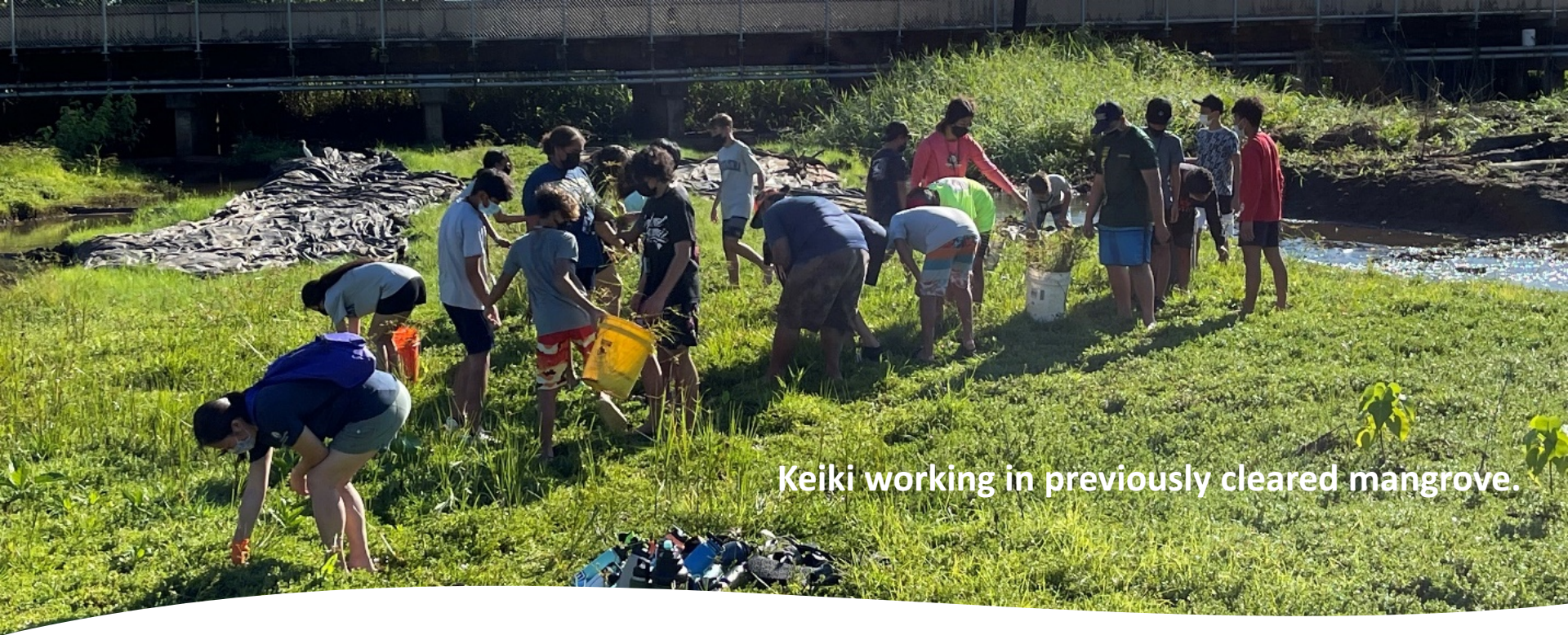
Keiki working in previously cleared mangrove.