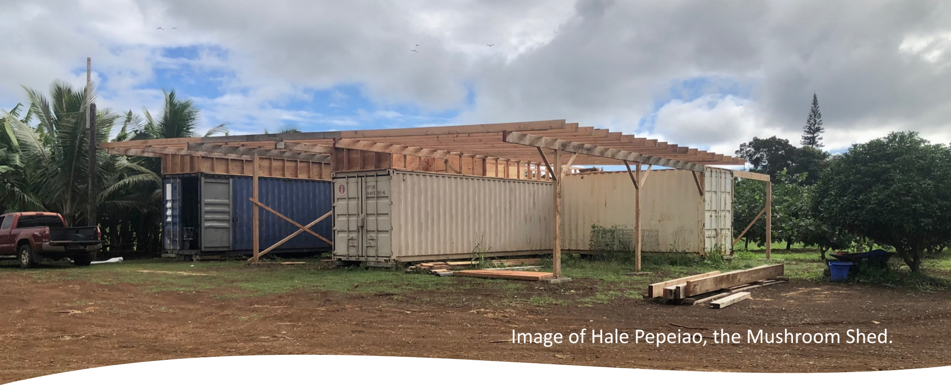
Image of Hale Pepeiao, the Mushroom Shed.