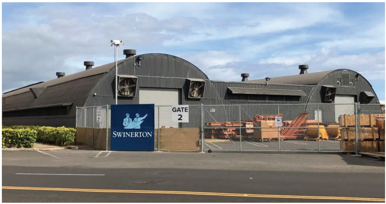
View of fencing along Enterprise Avenue façade.