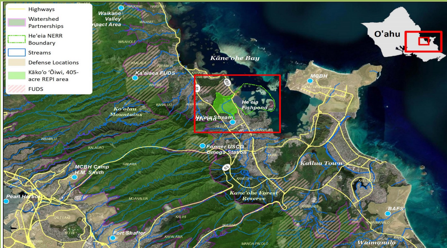
He'eia Watershed Restoration