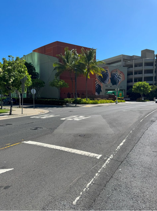
Queen Street (Kolowalu Park & Waimanu Street)