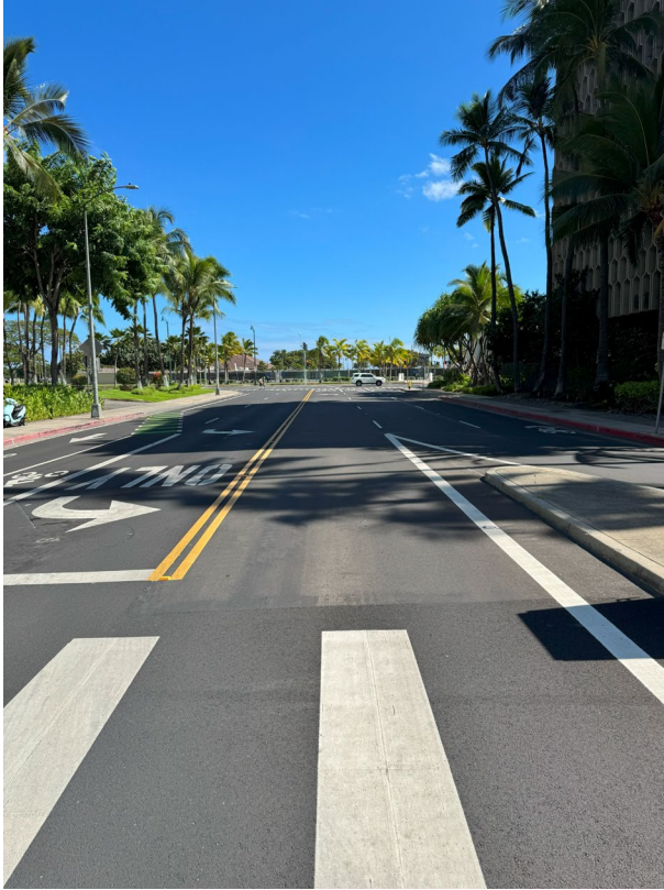
Queen Street (IBM building & Hokua)