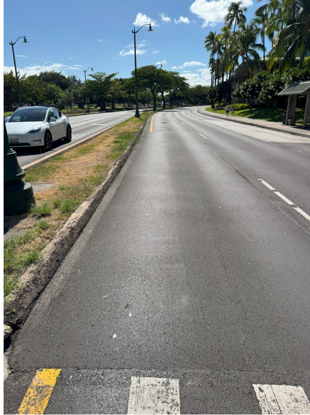
Ala Moana Boulevard (fronting IBM Building)