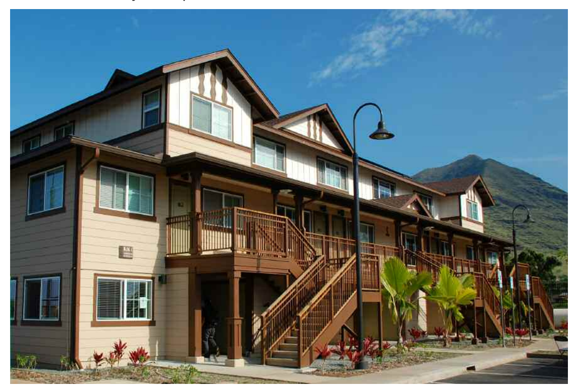
Hale Makana O Nanakuli is a new 48-unit affordable rental targeted at families earning 30-40% of Average Median Income (from $28,750 to $38,320 for a family of four), with rents not to exceed 30% of their gross area income.

The HHFDC partnered with the nonprofit Hawaiian Community Development Board and California company Urban Housing Communities to develop the transitional and long-term rental housing designed to meet the needs of the Nanakuli community, with focus on Nanakuli's low-income families. It will provide immediate relief to many Nanakuli families with overcrowded households, families living in dangerous dilapidated houses, and/or families who have been forced to abandon their homes.