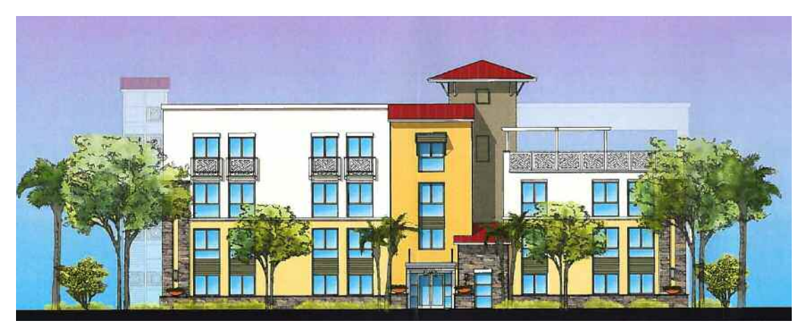
Hale Uhiwai Nalu Addition 50-unit new construction addition to the Hale Uhiwai Nalu for Veterans earning 80 percent and below AMI.

Ma'ili III Self-Help Housing - HHFDC provided interim DURF loans, for predevelopment and infrastructure costs for the 72-unit fee simple housing project located on the Waianae Coast of Oahu. Developer - Self Help Housing Corporation of Hawaii