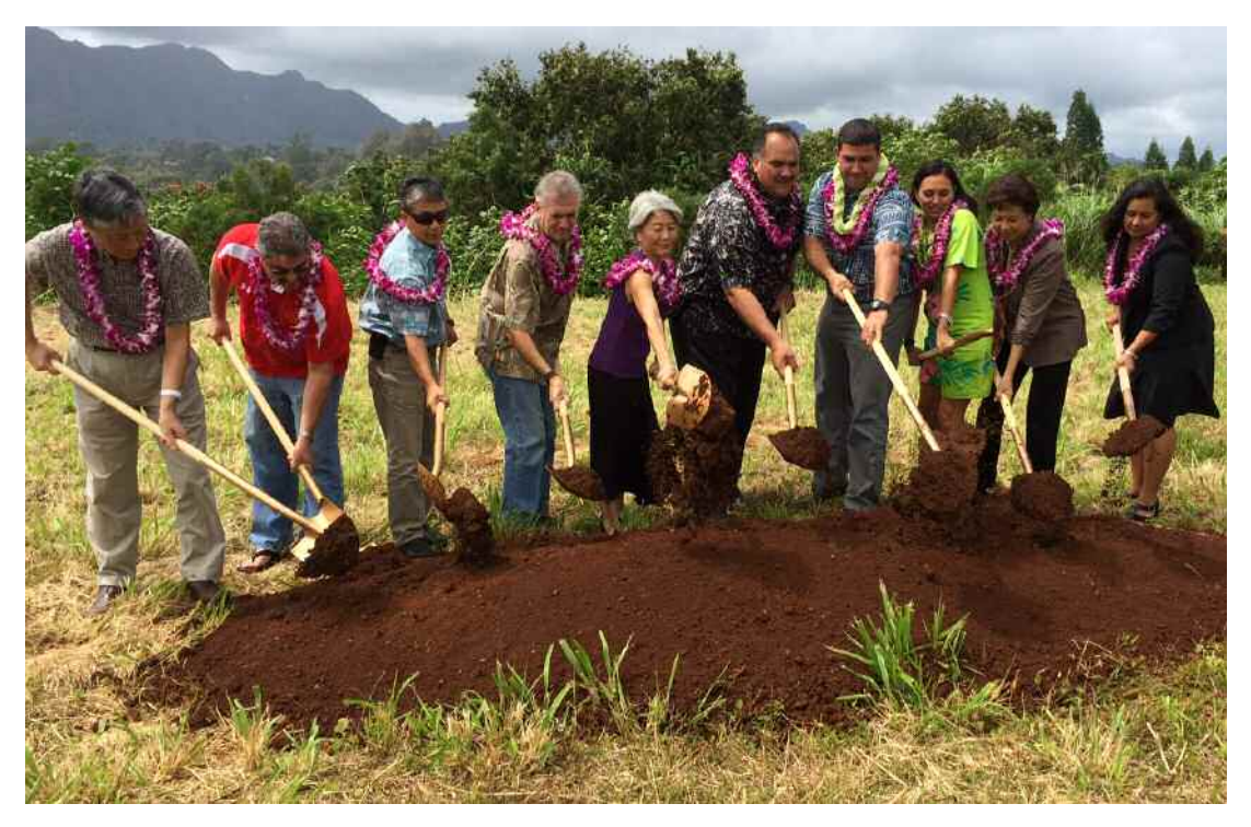
Rice Camp Senior A groundbreaking ceremony was held for the 60-unit senior community in Lihue, Kauai for seniors.

Ko`oloa`ula Phase II – 188-unit rental project in East Kapolei, Oahu. The ten three-story townhome rental is targeted at families earning 30 to 60 percent of AMI and will remain affordable for 63 years. Developer - Mutual Housing Association of Hawaii, Inc.