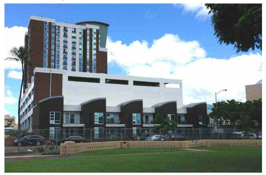
The 204-unit affordable family rental project built on state land, is a public-private partnership between the State and Stanford Carr Development, LLC. targeting families earning 60 percent of area median income.

The project consists of 204 studio, 1-bedroom, 2-bedroom, and 3-bedroom units configured in a 19-floor tower structure and a separate 282 stall parking structure.