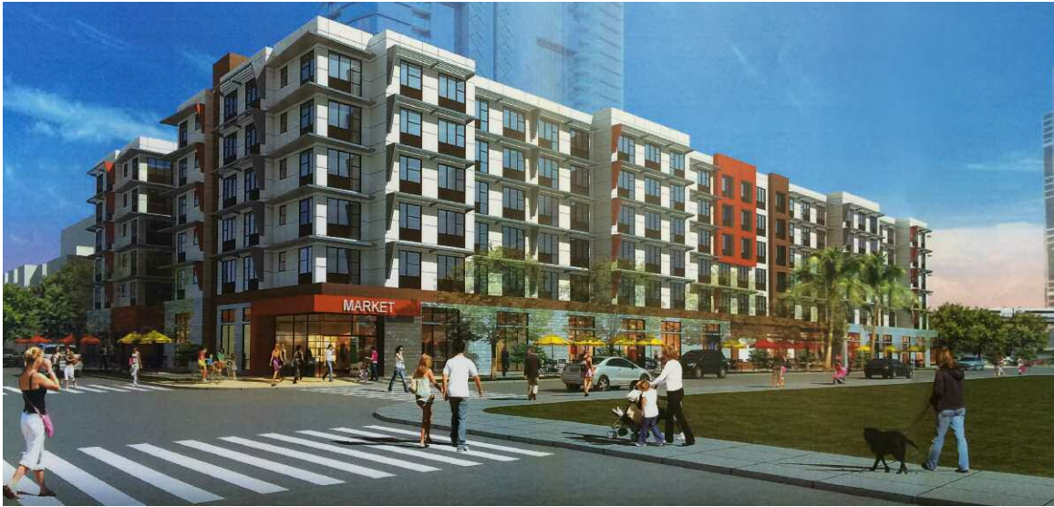
Keauhou Lane 209-unit mixed use development in Kaka'ako adjacent to the HART Civic Center Station

Kapiolani Residence – 485-unit mixed use residential project in Ala Moana near the HART Ala Moana Station. Kapiolani Residence is a 45-story residential and commercial project with approximately 3,353 square feet of commercial retail space. 60 percent of the units will be affordable with the remaining 40 percent at market rate. Developer - SamKoo Pacific, LLC - 201H/GET