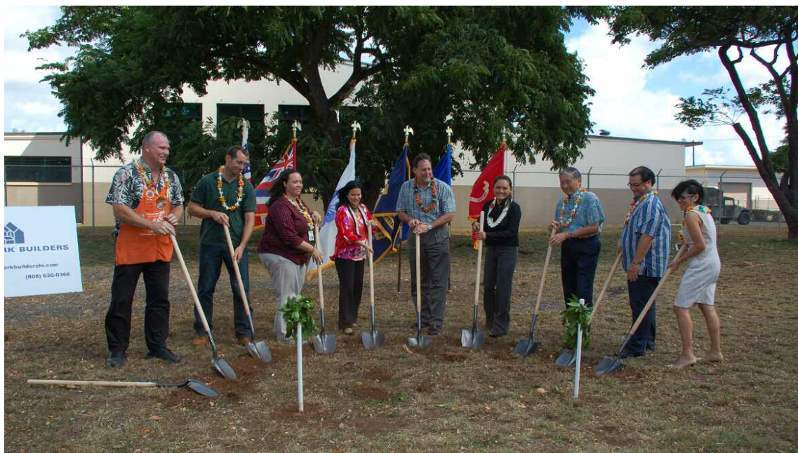
Hale Uhiwai Nalu Addition Groundbreaking for the 50-unit addition to Hale Uhiwai Nalu in Kapolei

Kamakana at Keahuolu – Master-planned community on 272 acres of non-ceded land in Keahuolu, Kailua-Kona, Hawaii. Approximately 1,169 units of the total projected 2,330 homes will be workforce and affordable. Developer - Forest City Hawaii Kona, LLC - LIHTC/RHRF/DURF/LAND