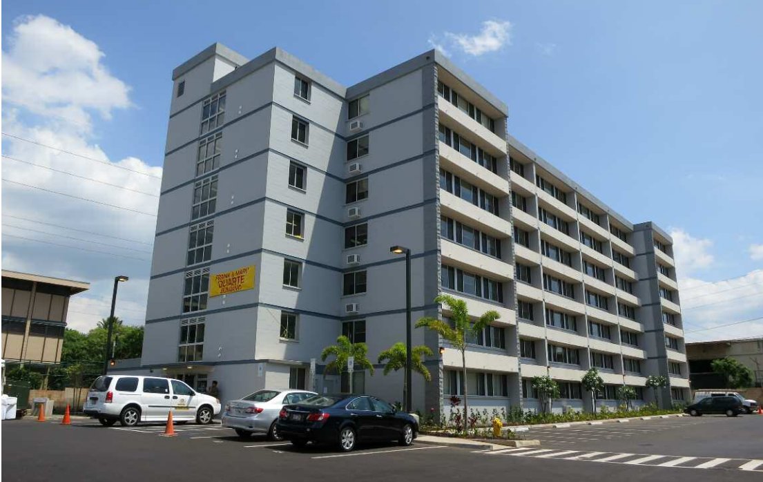
Hale Mohalu II, Phase III added 84 affordable family rentals in Pearl City. Phase IV will add an additional 84 family units in FY 2016.

Hale Mohalu II Family is the third of four, seven-story buildings on 4.7 acres of state land in lower Pearl City for low-income seniors and families, adding 84 two- and three-bedroom units for families at or below 60 percent of area median income. The two-bedroom units will range in size from 591 to 622 square feet, and the three-bedroom units will be approximately 751 square feet. Five percent of the units are designated for families or individuals earning up to 30 percent of area median income with the remaining 95 percent designated for families and individuals earning up to 60 percent of the area median income. Phase IV will add an additional 84 family units in FY 2016.