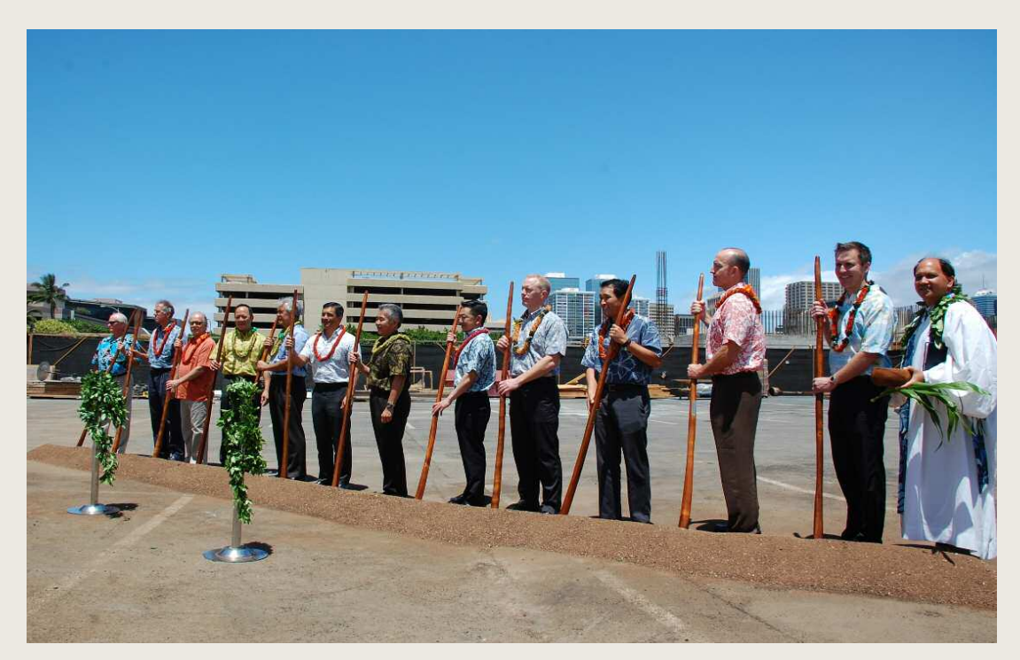
A groundbreaking ceremony was held for the 209-unit Keauhou Lane mixed-use project located across from the Honolulu Rapid Transit Authority's Civic Center Rail Station in Kakaako.

Keauhou Lane will include a blend of studios, one- and two-bedroom rentals, and 32,300 square feet of restaurant and retail space with 280 parking spaces. A pedestrian paseo will connect Keauhou Lane and Keauhou Place to the Honolulu Rapid Transit Authority's Civic Center Station.