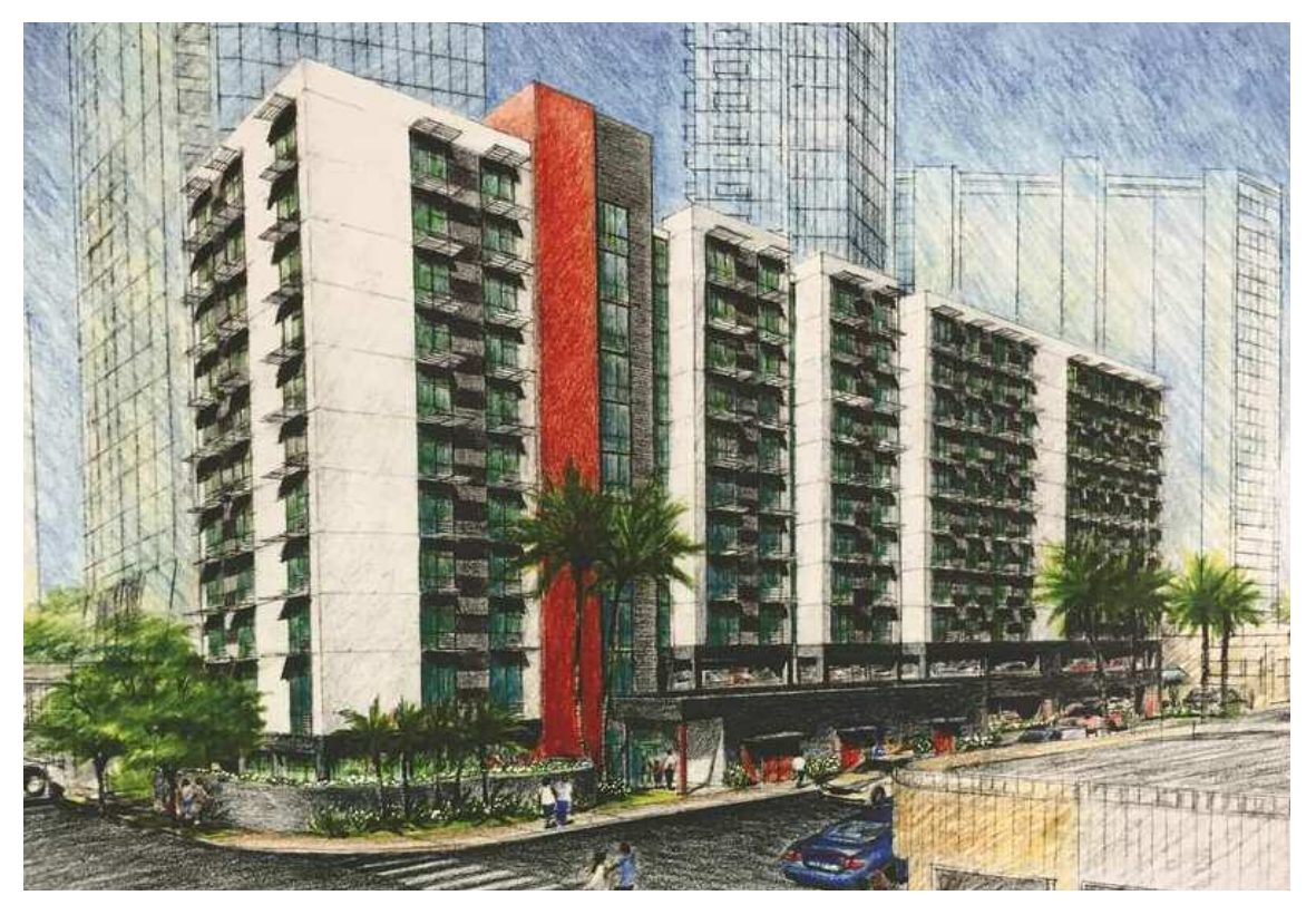
Hale Kewalo 128-unit rental near the HART Ala Moana Station

Hale Mahaolu Ewalu Phase I – 39-unit senior rental project in Pukalani, Maui. The one, two and three -bedroom units are targeted at seniors earning 30 to 60 percent of AMI. Developer - Hale Mahaolu Ewalu LP - LIHTC/RHRF/DURF