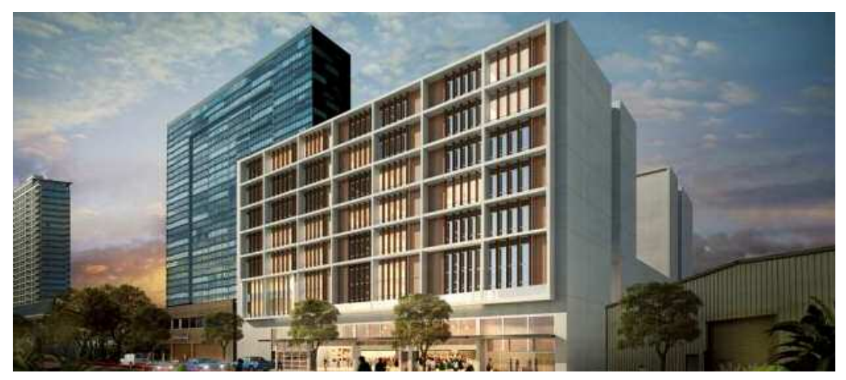
Artspace 84-unit mixed use development in Kakaako near the HART Ala Moana Center Station

Hale Ohana – 180-unit for-sale project in McCully. The project consists of 78 studio, 87 one-bedroom and 15 two-bedroom units targeted at buyers earning 80 to 120 percent of AMI. Developer - MJF Development Corpora tion - DURF/201H