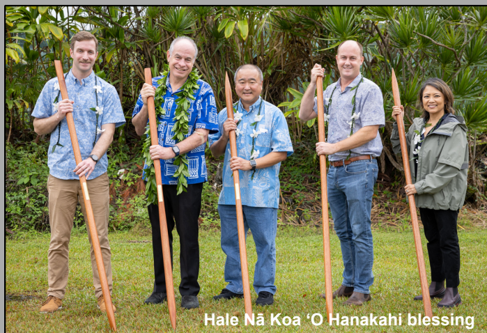
Hale Nā Koa 'O Hanakahi blessing