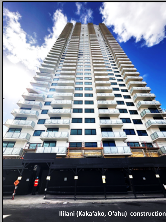
Ililani (Kaka'ako, O'ahu) construction

Halewai'olu Senior Residences: 156-unit rental project in Chinatown, O'ahu for seniors earning 30%-60% AMI. LIHTC/HMMF/RHRF Developer: The Michaels Organization | Scheduled completion: 2024