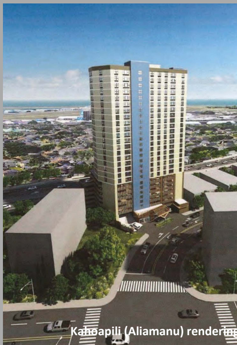
Kahoapili (Aliamanu) rendering