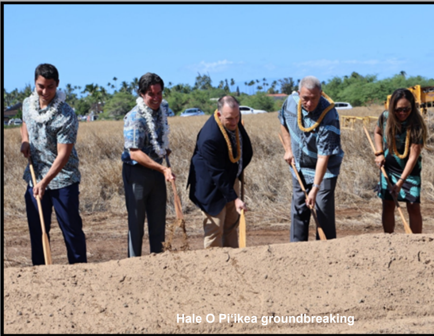
Hale O Pi'ikea groundbreaking