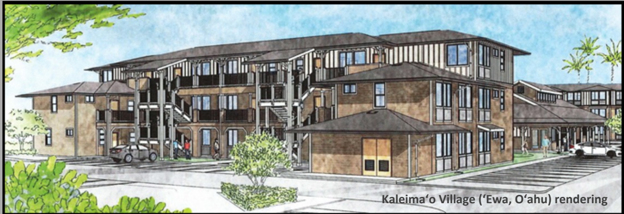
Kaleima'o Village (Ewa, O'ahu) rendering

Kaiāulu O Kapi'olani: 64-unit rental project for families earning 30%-60% AMI in Hilo, Hawai'i.