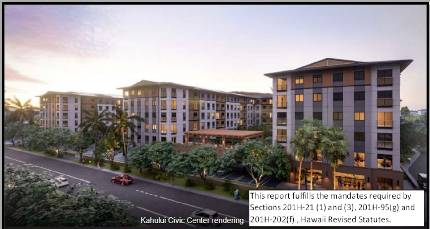
Kahului Civic Center rendering

This report fulfills the mandates required by Sections 201H-21 (1) and (3), 201H-95(g) and 201H-202(f) , Hawaii Revised Statutes.