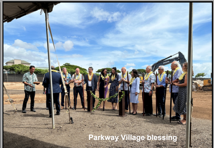
Parkway Village blessing