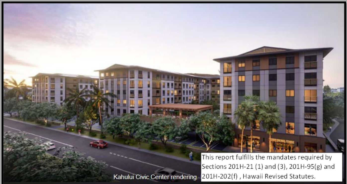
Kahului Civic Center rendering

This report fulfills the mandates required by Sections 201H-21 (1) and (3), 201H-95(g) and 201H-202(f), Hawaii Revised Statutes.