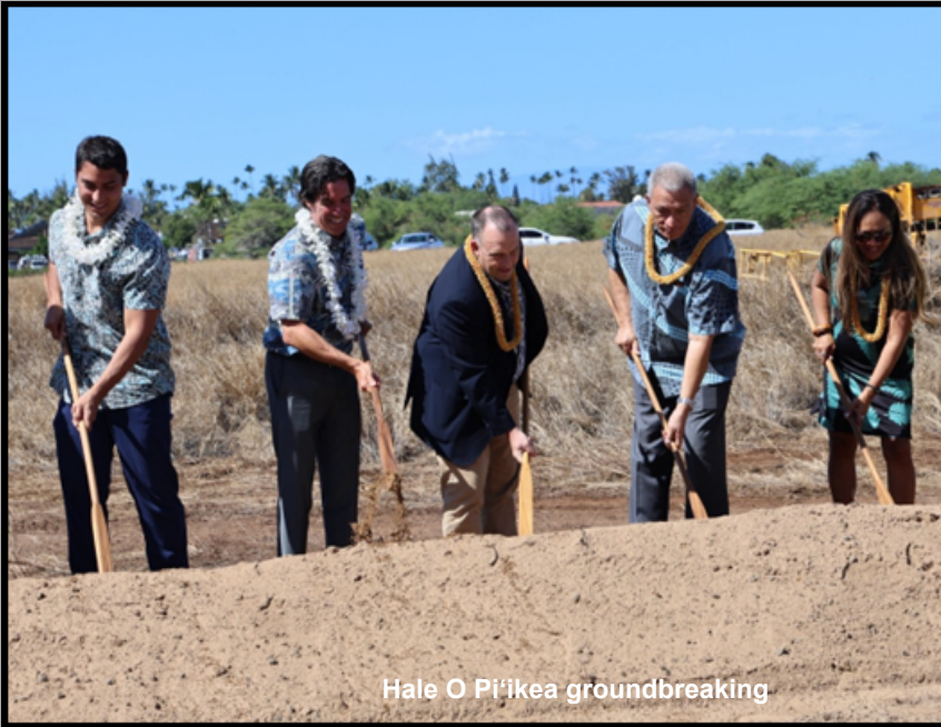
Hale O Pi'ikea groundbreaking