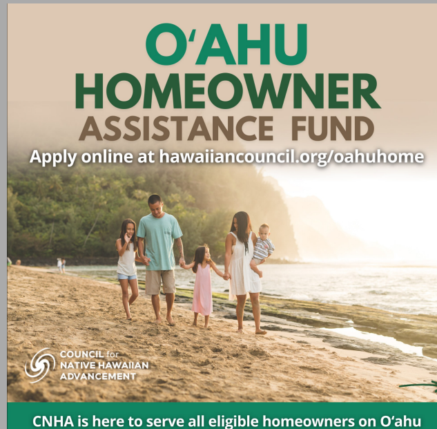
O'ahu Homeowner Assistance Fund flyer