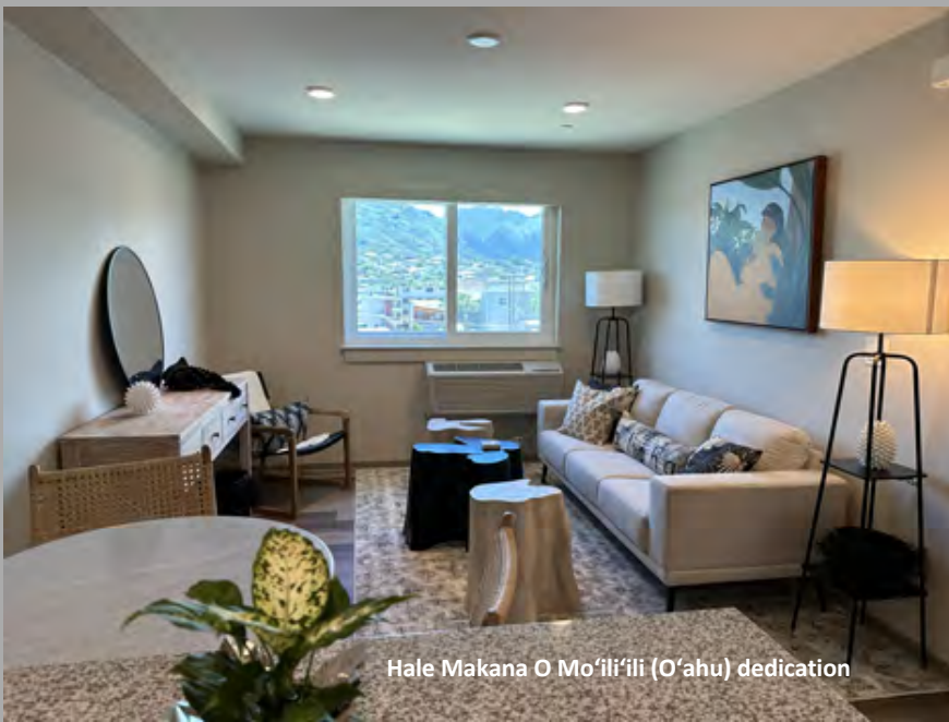
Hale Makana O Mo'ili'ili (O'ahu) dedication