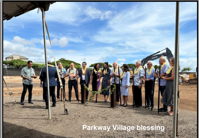
Parkway Village blessing