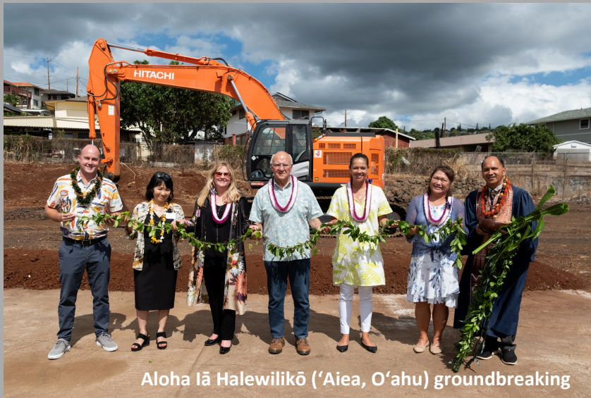
Aloha Iā Halewilikō ('Aiea, O'ahu) groundbreaking

690 Pohukaina: 631-unit family rental project in Kaka'ako, Oahu for households earning 30%-140% AMI. 201H/Land/DURF/RFP Developer: Highridge Costa Development Co. | Scheduled completion: 2027