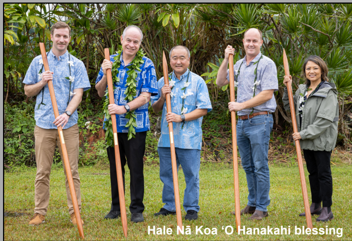
Hale Nā Koa 'O Hanakahi blessing